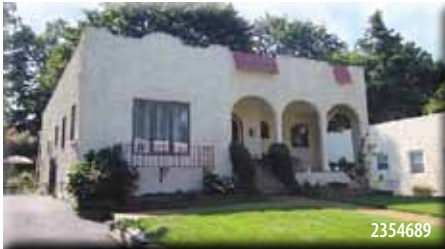
Glen Cove $375,000 Roomy Ranch! Charming 3 bdrm, living room with fireplace, dining room, kitchen, bath, full basement & private yard.