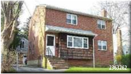
Glen Cove $410,000 Huge 5 bedroom, 2 bath Colonial. Updated baths, huge cooks eat-in kitchen, gleaming hardwood floors, garage with loft!