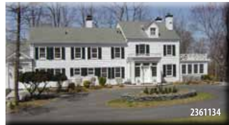
Port Washington $2,749,000 Meticulously restored 100 yr old Colonial Manor House on 2.7 pristine acres. Formerly owned by Guggenheims & Harrimans. 6 bdrs, 5.5 bths, 2 kits, 3 fplcs, heated IG pool, w/hot tub, Gazebo, Vineyard & sep guest wing. Access to priv. beach. Port Washington Properties, Inc. (516) 767-6655

Port Washington is a bustling and diverse suburb of New York City located on the North Shore of Long Island. An active waterfront community, the area is surrounded on three sides by the Long Island Sound, Manhasset Bay and Hempstead Harbor. Located within the Town of North Hempstead, Nassau County, the area is just about 5 square miles and includes unincorporated areas and several Incorporated Villages: Sands Point, Baxter Estates, Flower Hill, Port Washington North and Manorhaven. The Port Washington train station is the last stop on a train line that runs directly into NYC in 35 minutes.