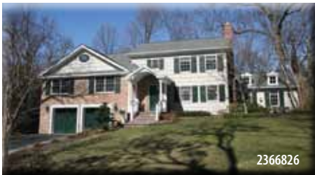
Port Washington $1,799,000 PERFECTION! This 5 br, 3 fth home is tucked away on a private 1/3 acre. LR/fpl, DR, top of the line country EIK opening to Great Room w/fpl. Incredible details, no amenity overlooked! 2 car gar, CAC, sprinkler, more. Walk to town and RR. Accents on Real Estate (516) 944-7171 • (516) 627-9360