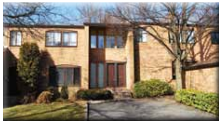
Roslyn/North Hills $735,000 Spacious & Renovated 3 Bedroom, 2.5 Bath Townhouse Condo In The Gates At North Hills. Large Deck Overlooking Beautiful Property. Full Finished Basement. Great Neck Schools. Prudential Douglas Elliman Real Estate (516) 466-2100