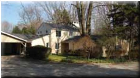
Port Washington/Sands Point $1,899,000 2 Acres includes a private tennis court, in-ground pool, and winter waterviews. Beautifully upgraded California Mission-Style home includes 5 bdrs, 2.5 baths, huge fam rm, LR w/fp, DR, new Kitchen & MBR suite w/private balcony. Harding Real Estate (516) 944-3870