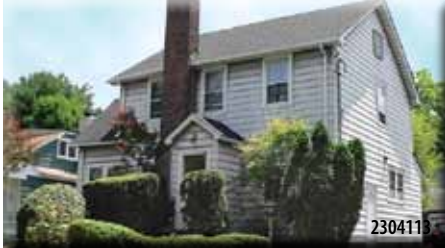
Glen Cove $399,000 Country Fresh Kitchen! Renovated Colonial, living room with fireplace, formal dining room, updated eat-in kitchen, 3 bedrooms, 2 new baths.