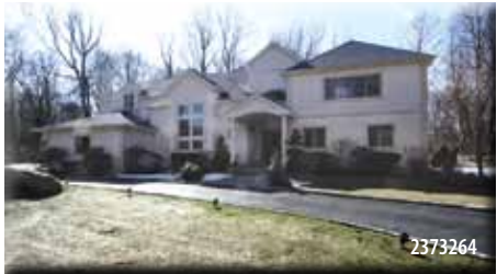
Port Washington/Sands Point $2,899,000 Grand & elegant totally rebuilt 5 br, 4.5 bth 5000 sq. ft colonial on 2+ acres. LR w/23 ft. ceiling, FDR w/French Door to deck. Custom gourmet kit opens to Family Room w/fpl. Full basement, attached 2 car garage. Many custom features incl. dramatic staircase! Accents on Real Estate (516) 944-7171 • (516) 627-9360