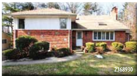
Roslyn Heights $750,000 Spacious 5 Bedroom, 2.5 Bath Split With Sunken Livingroom W/ Fireplace & High Ceilings, Main Floor Den, Formal Dining, Eik With Access To Huge Backyard And Deck, Lower Levels Have A Guest Room And .5 Bath, Finished Basement And 2 Car Garage. Prudential Douglas Elliman Real Estate (516) 466-2100