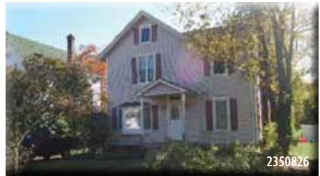
Glen Cove $405,000 By the Fire's Glow... Relax in the living room with roaring fire, formal dining room, new eat-in kitchen, 3 bedrooms, 2 new baths.

The term Great Neck is commonly applied to a peninsula on the North Shore of L.I., which includes the Villages of Great Neck, Great Neck Estates, Great Neck Plaza, and others, as well as an area south of the peninsula near Lake Success and the border of Queens. It's a 25-minute commute from Manhattan's Penn Station on the Port Washington Branch of the Long Island Rail Road via the Great Neck station, which is one of the most frequently served in the entire system. Great Neck is home to one of the top school districts in Nassau County.