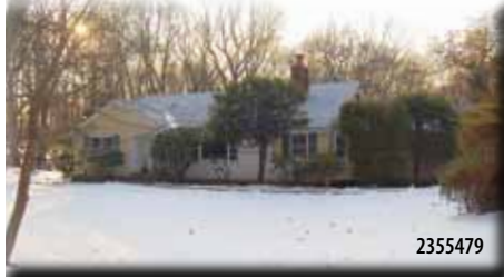
Port Washington/Sands Point $1,895,000 Deceptively spacious 5 bedroom, 3.5 bath Harbor Acres home set upon lush, nearly 2 acre grounds w/renovated ig pool. Large LR w/brick fp, FDR, sunroom, den w/fp, and huge fin bsmt. FOR SALE AT $1,895,000 OR RENT $5,450. Harding Real Estate (516) 944-3870