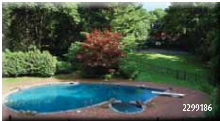
Port Washington/Sands Point $2,499,000 Contemporary built w/ finest materials on 1.7 acre property w/ stunning ig pool and priv tennis court. Chefs kitchen with prof grade appliances. 2 story LR/DR w/ walls of glass overlooking grounds. Master Bdrm Suite w/fp & balcony. Harding Real Estate (516) 944-3870