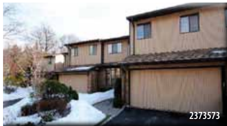
Roslyn/North Hills $699,000 3Br, 2.5 Bth Townhouse Condo In The Village Of North Hills. 2 Story Entry Open Floor Plan, Lr W/ Fire Pl, And Large Eat-In-Kitchen. Master Suite w/ Dressing Area, Two Huge Closets And A Large Bath. Fin Bsmt. Central Vacuum & Air. 2 Car Att Garage. Prudential Douglas Elliman Real Estate (516) 466-2100