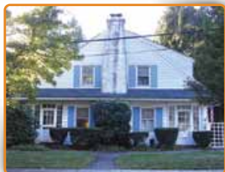
Port Washington $799,000