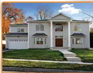
Port Washington $1,875,000