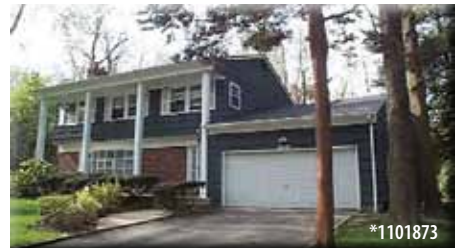
Great Neck $1,250,000 Great Neck Estate Colonial. Great Location, Great Property. 4 Bedrooms On Second Floor, Laundry Off Kitchen, Convenient To All.

Prudential Douglas Elliman Real Estate (516) 466-2100