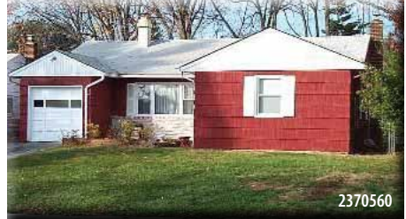
Glen Cove $399,000 Charming 3 bedroom ranch, living room, dining room, new kitchen, master bedroom, 2 full baths, cul de sac location!