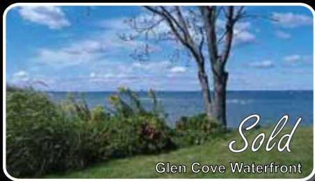
Glen Cove Waterfront