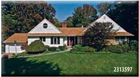
Port Washington $1,499,000 "HARBOR ACRES" Wonderful family community with its own Tennis, Mooring & Beach Rts. 4 Br Expanded Ranch, 3 New Bths, Newer spacious EIK, CAC, HW Fls. Just shy 2 Acres of lush property. Point To Port Realty Ltd. (516) 944-6800