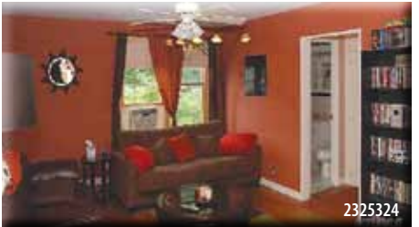
Glen Cove $169,000 No Fuss! Live the easy life in this chic co-op! Large 1 bedroom, kitchen, dining area, living room. Laundry & gym on site.