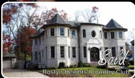
Roslyn Heights/ Country Club