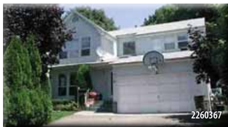
Roslyn $850,000 The Most Spacious, Young Contemporary Colonial Home In The Area. Younger, This Bright & Cheerful Home Offering All Large Rooms With Open Floor Plan, Great Family Home In Excellent Location, Roslyn Schools Walk To All. Lynx Realty (516) 484-9696