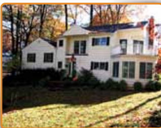
Port Washington $979,000