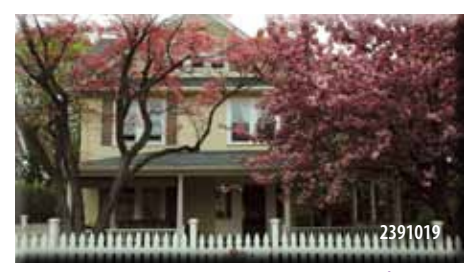
Sea Cliff $629,000

A large wrap-around porch welcomes you to this large 4 BR, 1.5 Bth Victorian boasting an updated EIK and Baths, private cul-de-sac location, and many charming details. NS Schools, beach privileges.