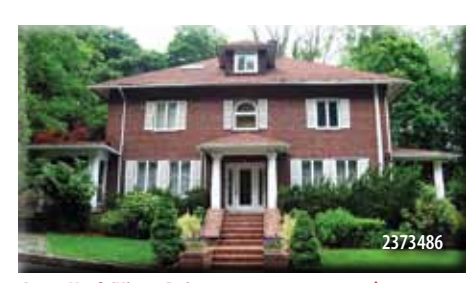
Great Neck/Kings Point

The term Great Neck is commonly applied to a peninsula on the North Shore of L.I., which includes the Villages of Great Neck, Great Neck Estates, Great Neck Plaza, and others, as well as an area south of the peninsula near Lake Success and the border of Queens. It's a 25-minute commute from Manhattan's Penn Station on the Port Washington Branch of the Long Island Rail Road via the Great Neck station, which is one of the most frequently served in the entire system. Great Neck is home to one of the top school districts in Nassau County.