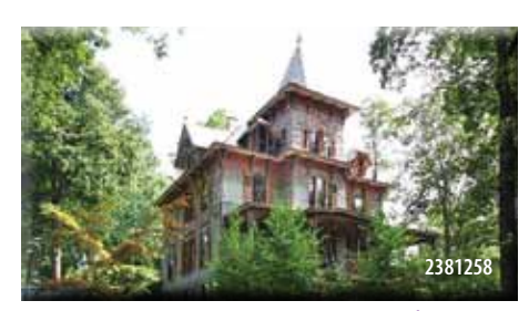
Sea Cliff $1,499,000

A Sea Cliff Icon. A huge wrap-around porch embraces this 7BR, 3.5Bth restored Victorian featuring spacious sun-lit rooms, 10' ceilings, parquet floors, pocket doors, marble fireplaces. Huge lower level guest quarters, CAC, oversized lot.