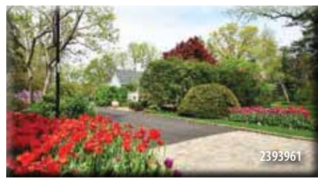
Great Neck/Kings Point