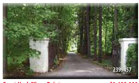
Great Neck/Kings Point