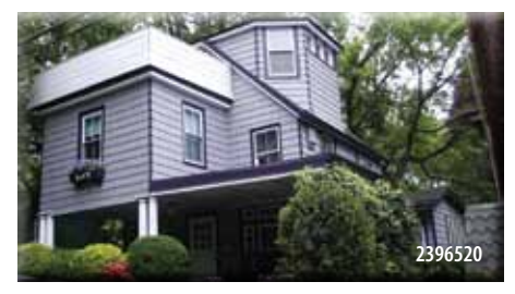
Sea Cliff $699.000

Elegant 3 BR, 1.5 Bth water view Victorian featuring EIK with walls of glass overlooking the Harbor. LR w/gas fireplace, Mstr Suite w/Office and roof Deck, CAC, NS Schools, beach privileges.